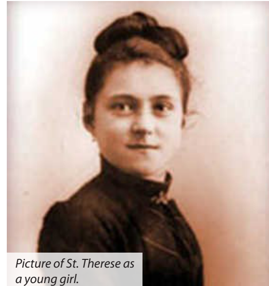
Picture of St. Therese as a young girl.

Let's contrast these thoughts with the example of St. Therese of Liseux who would ask her mother superior for the most menial, common chores around the convent, just so she could devote herself out of humility to cleaning the bathrooms and sweeping the floors to the very best of her ability. One day, while St. Therese was praying in her cell, the devil appeared as a giant, hideous beast. While the beast roared and flaunted his own power, St. Therese began to laugh! In her great humility, she recognized the worthlessness of the devil and laughed at him. The humble joy of Therese drove the devil crazy until he was reduced so small in size that he ran out of her room underneath the crack of the door. Wherever we find ourselves in life, at work, play or study, let us recognize pride in all its forms and like Therese, banish it once and for all.