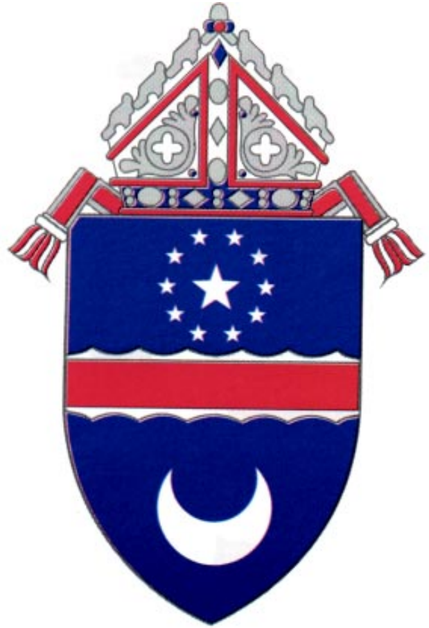
Arlington Diocese Coat of Arms