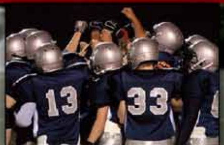
HOME SCHOOLED ATHLETES