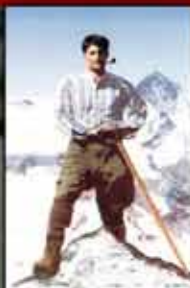
REACHING THE SUMMIT