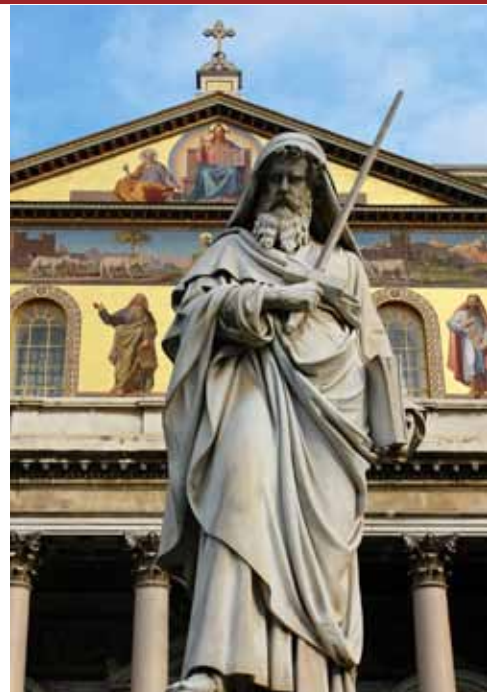
Statue of St. Paul at the Basilica of St. Paul Outside the Walls in Rome

John Paul II, a great sportsman in his own right, a man who loved soccer and skiing, prayed in his October 2000 homily on the jubilee of athletes that athletes everywhere “be sound models to imitate for all who admire them. Help them always to be athletes of the spirit, to win your inestimable prize: an imperishable crown that lasts forever.” Let us pray with him, remembering that only the best athletes win the prize, but that everyone has a chance to be the best in his own spiritual race. With perseverance and by the grace of God we shall all be able to say with St. Paul on the last day, “I have fought a good fight, I have finished my course, I have kept the faith” (II Tim. 4:7).