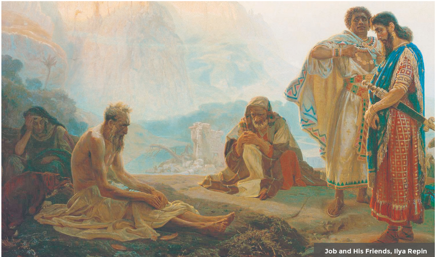
Job and His Friends, Ilya Repin