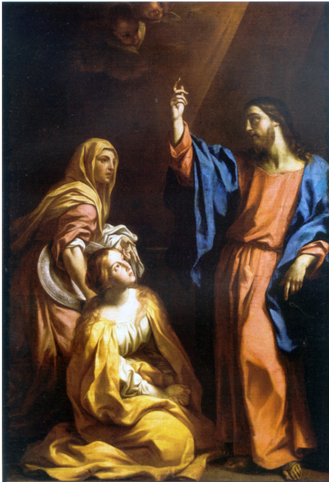
Mary and Martha Speaking to Jesus by Reni

Do Ex. 262 on p. 243. Write out your translation for Reading No. 14.