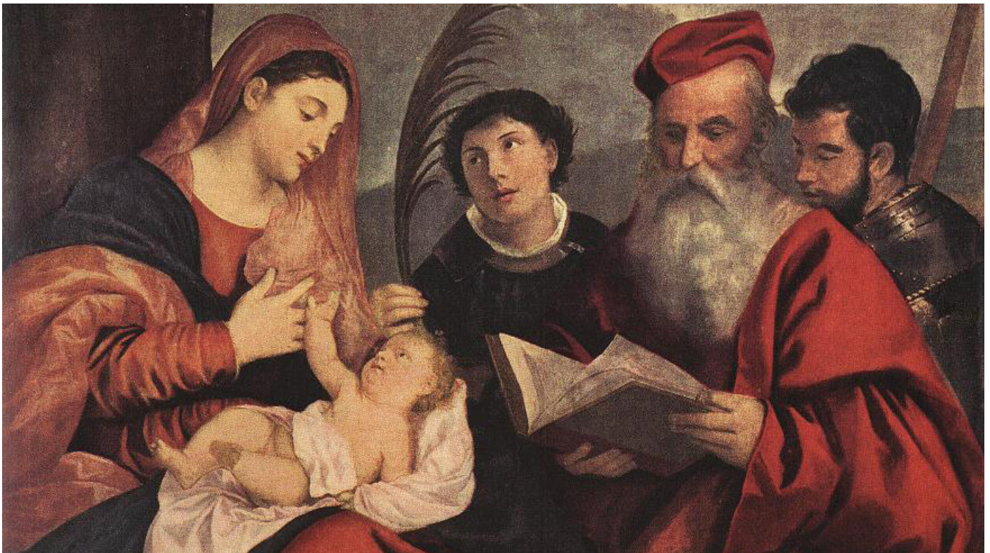
Mary with the Child and Saints, Titian

Notice the beautiful Madonna and Child with St. Joseph and St. John . Have you ever seen the face of the Child Jesus with a smile like that?