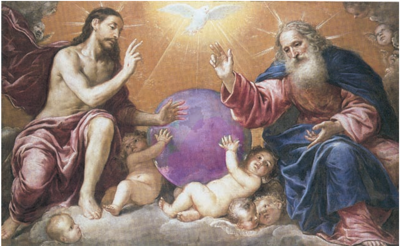
The Blessed Trinity

God the Father is the First Person. God the Son, Jesus Christ, who became Man, is the Second Person. God the Holy Spirit is the Third Person.