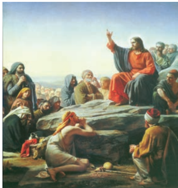
Sermon on the Mount

Our Father, Who art in Heaven, hallowed be Thy name; Thy kingdom come; Thy will be done on earth as it is in Heaven. Give us this day our daily bread; and forgive us our trespasses as we forgive those who trespass against us; and lead us not into temptation, but deliver us from evil. Amen.