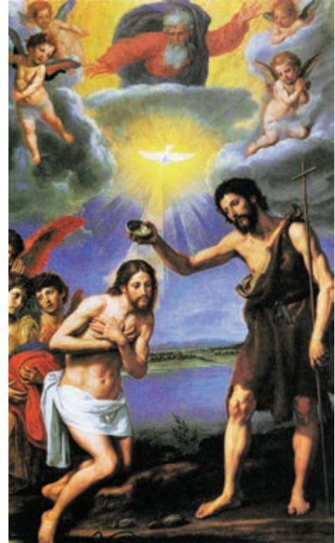
The Baptism of Our Lord

Glory be to the Father, and to the Son, and to the Holy Spirit. As it was in the beginning, is now, and ever shall be, world without end. Amen.