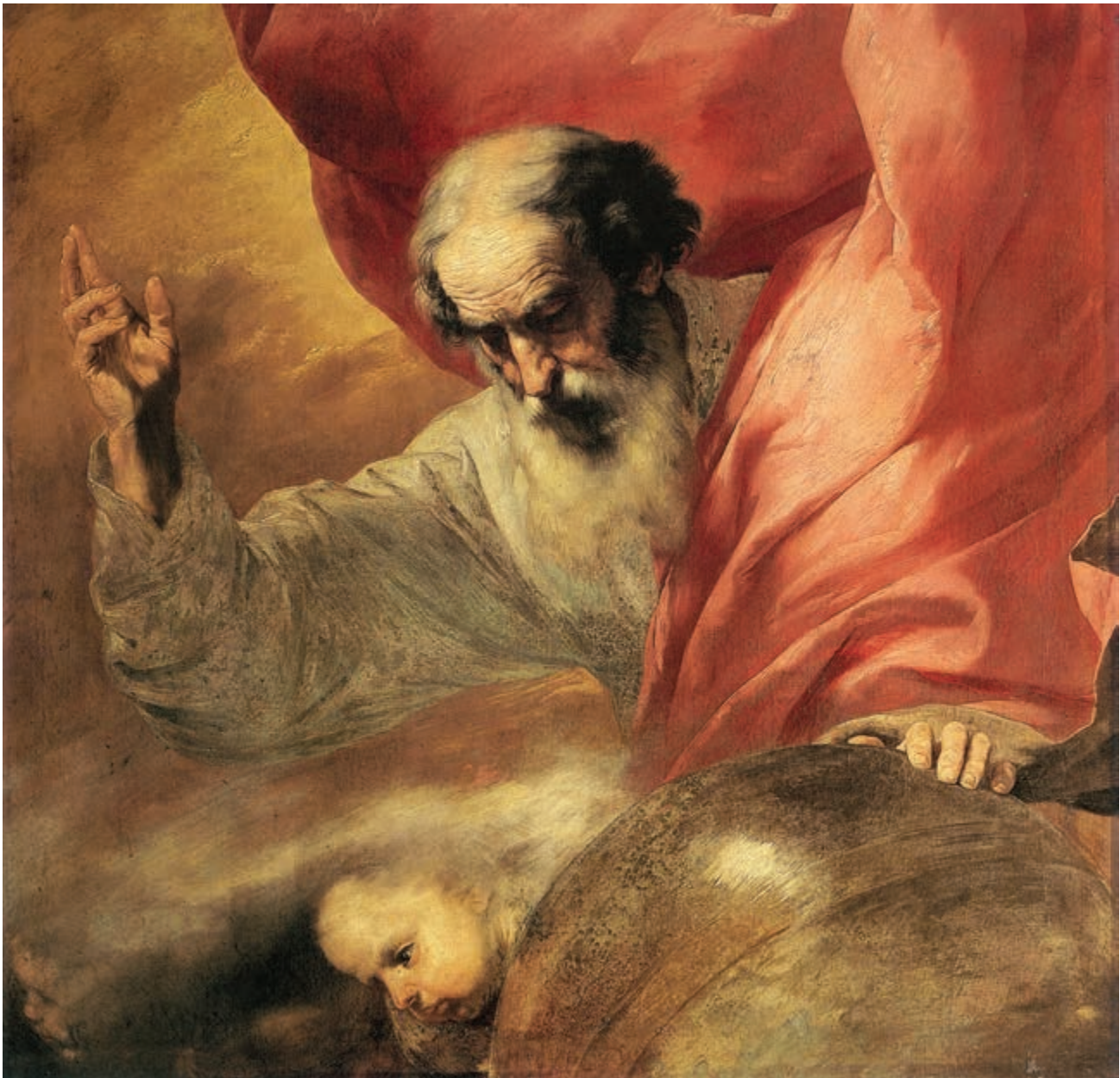
God is the Supreme Being.

God is the Supreme Being. He is all mighty. He is all good. He knows everything. He loves you and me.