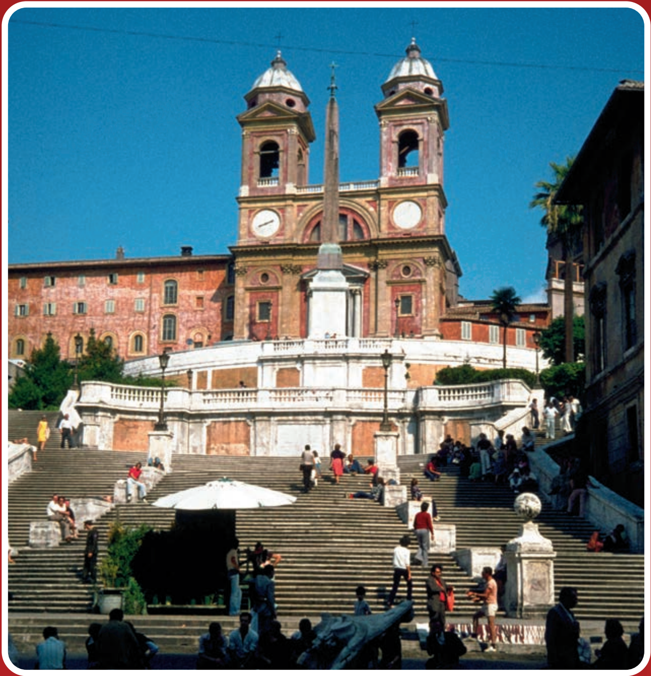
Santissima Trinità dei Monti Rome, Italy