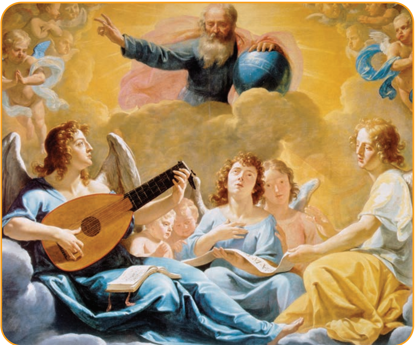
In Heaven, the angels praise God.

Read to your child the story of Isaiah and Jeremiah (p. 83) and Tobiah and the Angel (p. 84) from The New Catholic Picture Bible .