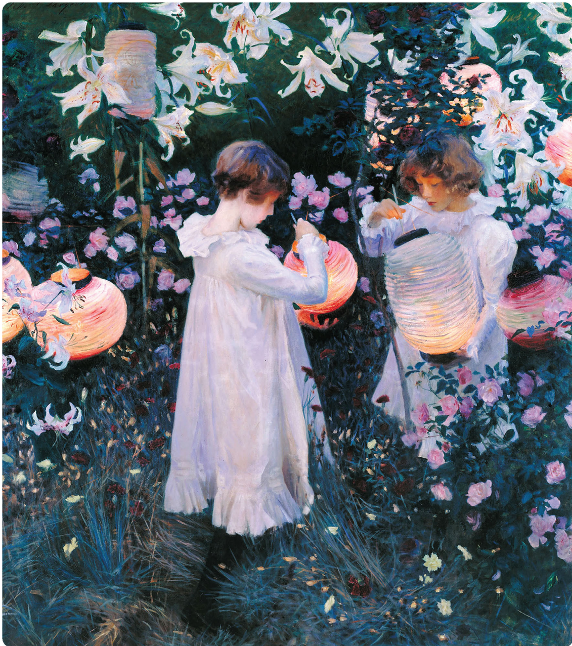
Carnation, Lily, Lily, Rose John Singer Sargent, 1886