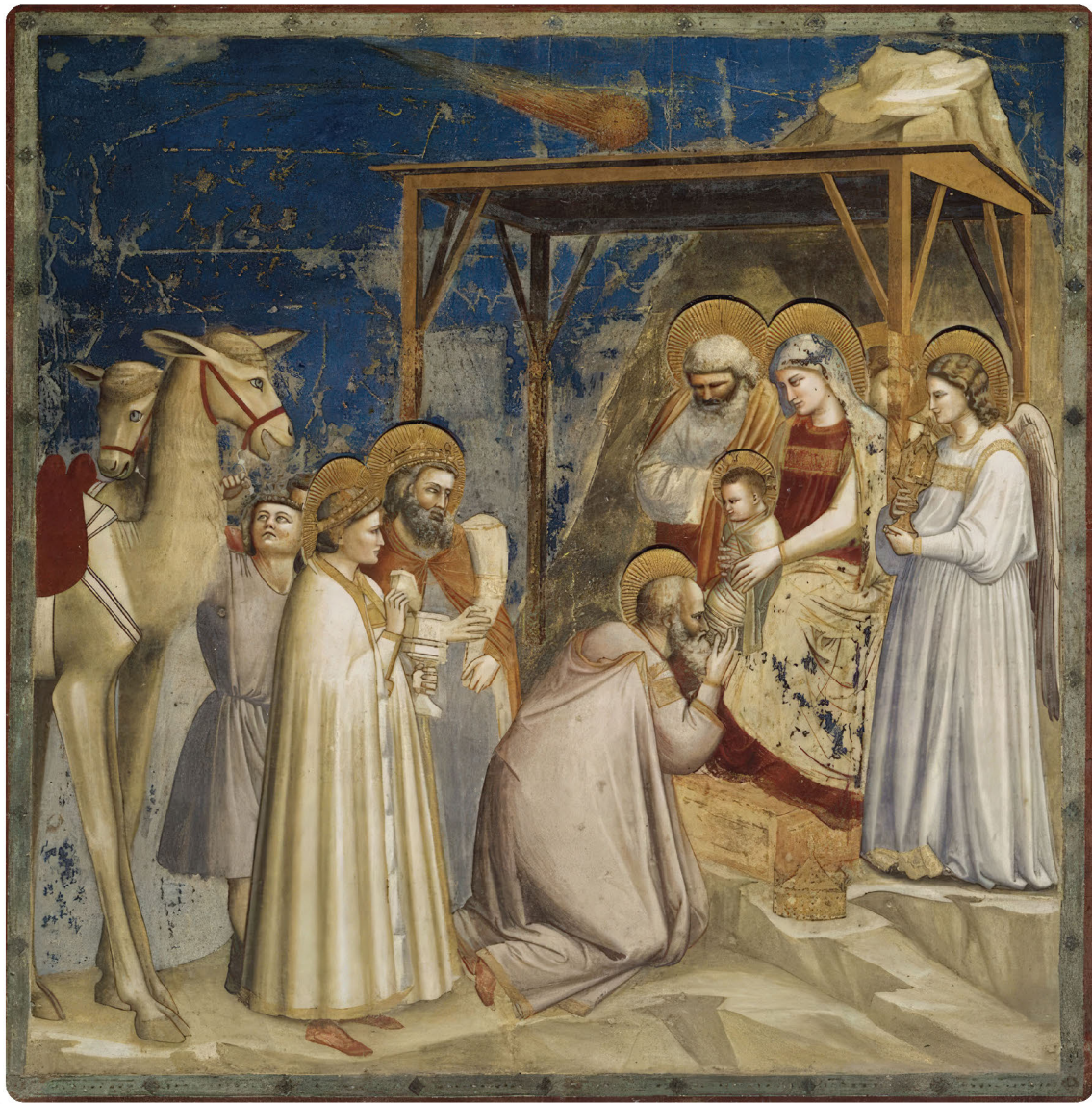
Adoration of the Magi Giotto di Bondone, 1306

HOW MANY STARS CAN YOU SEE IN THE NIGHT SKY?