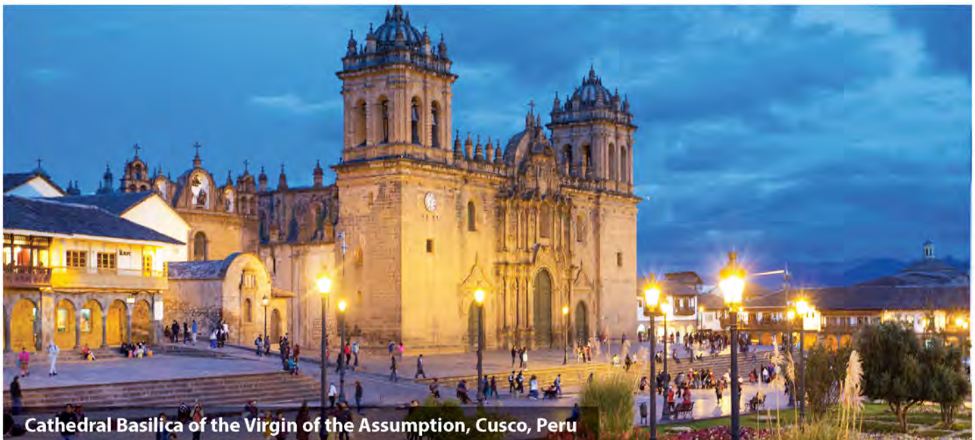
Cathedral Basilica of the Virgin of the Assumption, Cusco, Peru

If you wish, you may enter the home grade averages over the Internet instead. Log on to your MySeton page, on the top right of Seton’s website ( www.setonhome.org ), by entering your family ID number and password. In the upper right corner, be sure to click on the name of the correct student. Then click Courses on the top of the page. Go to History 2 in the table and click on “view” under Q1. You will see a yellow box for the home grade. To enter a grade, click on “Enter Parent Grades.” This will open a new blank box in place of the yellow one under “Grade.” Type the grade in this box, and click on “Submit Parent Grades.”